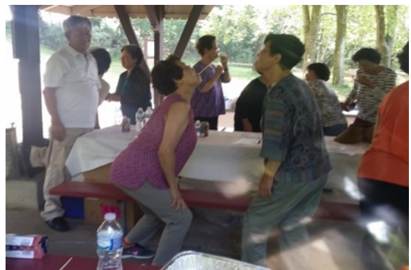
Fun in the park...