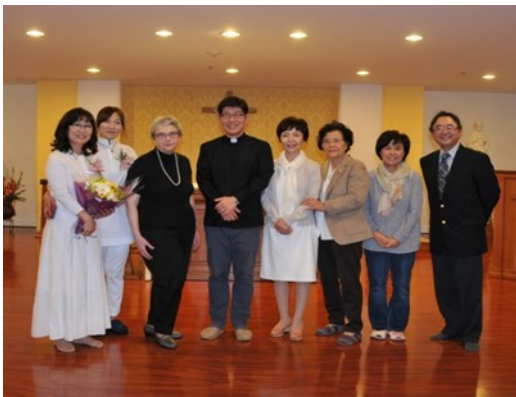
Annual Day of Retreat and Commitment Ceremony

2/4/2017: MAR-KCLC New Year's Party: Celebrated the new year by sharing New Year's Resolution as CLCers among members over the good food and performances.