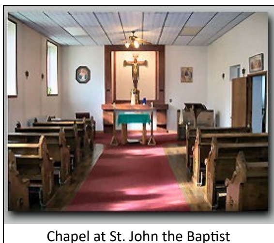
Chapel at St. John the Baptist